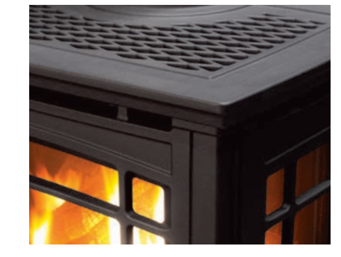
European castings - Painted Black