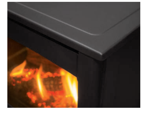
Formed steel outer construction