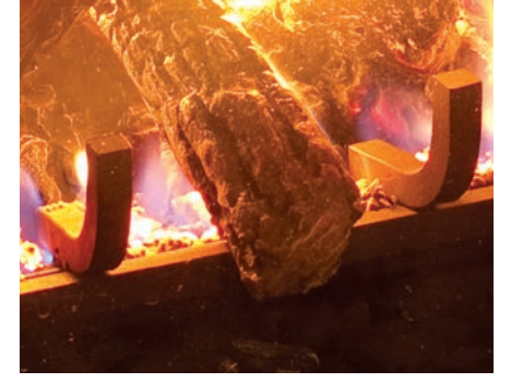
Steel fireplace grate