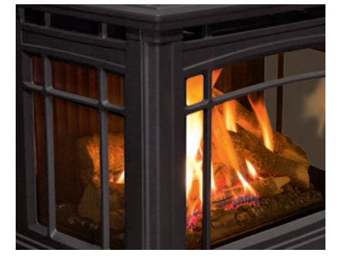
Flame visible from three sides