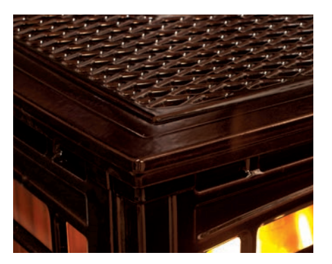
European castings - enameled antique chestnut