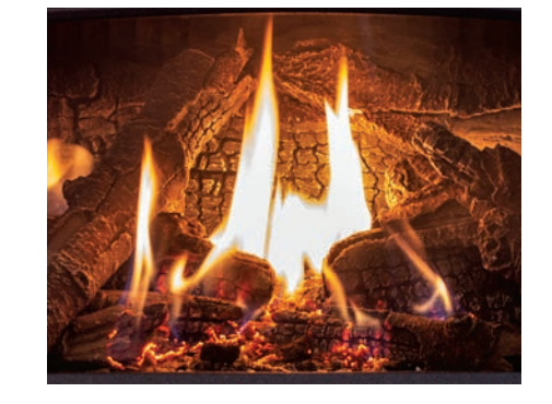
8 Piece ultra high definition log set