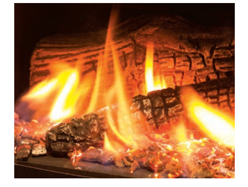
High definition log set