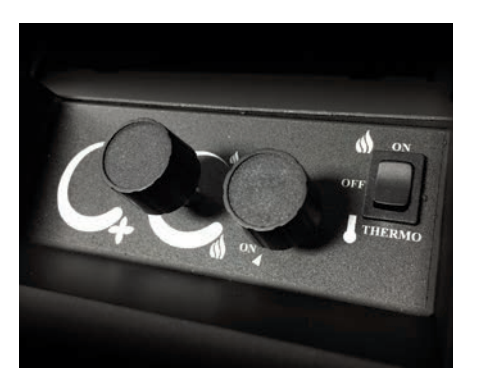
Easy access controls