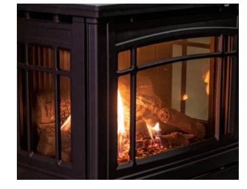
Flame visible from three sides