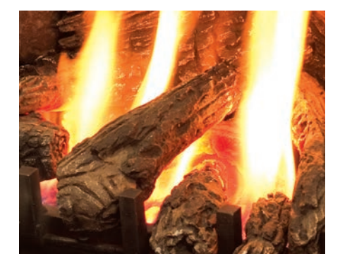
High definition log set