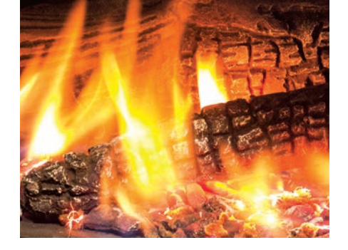
High definition log set