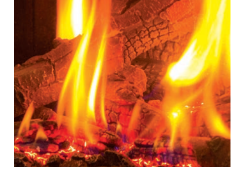
9 Piece ultra high definition log set