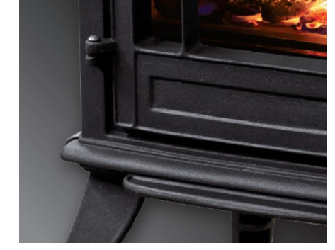
Cast iron doors