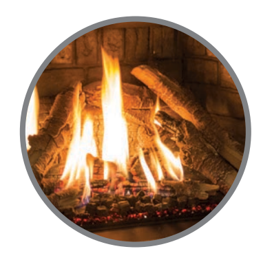
ULTRA HIGH DEFINITION LOG SET Available for the EX32, & EX35