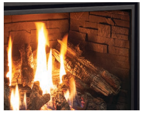
Traditional Log Set with Ledgestone Liner