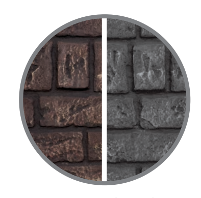
BRICK LINER (Original or Graphite Grey) Available for the Q1, E20, E25, E30, EX32, E33, EX35, & E44 (Graphite Grey not available for the Q1, E20, E25, or E44)