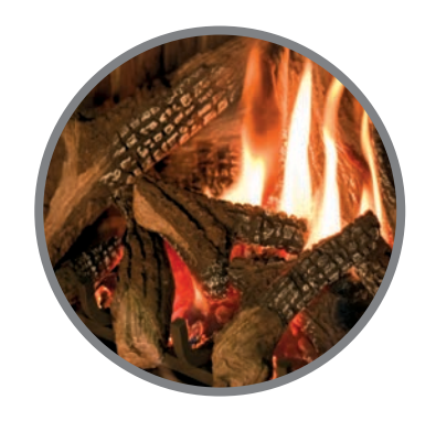
CLASSIC LOG SET Included with the Q1 & E20