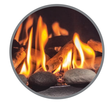
RIVER ROCK SET Available for the E33 Glass