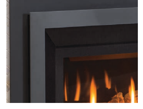
Designer Series Surround