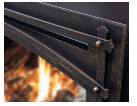
Midnight Bronze Forgeworks Surround

† Based on installation with the Contemporary Surround. Depth can vary by panel.