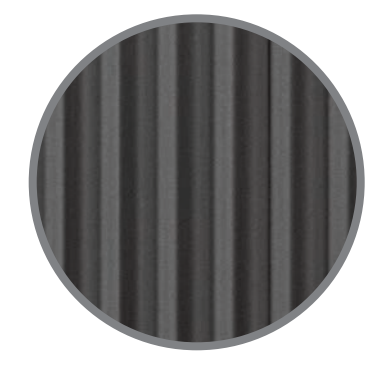
FLUTED LINER Available for the E20, E30, EX32, E33, EX35, & E44