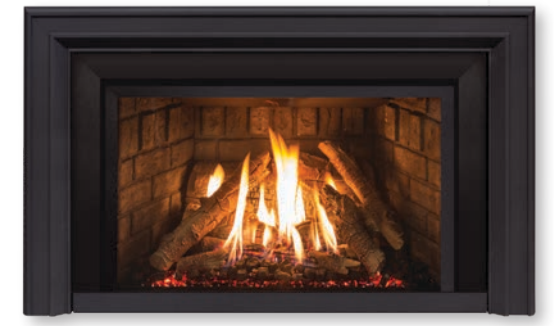
CAST PLUS SURROUND Available for the E30, E33, EX32 & EX35