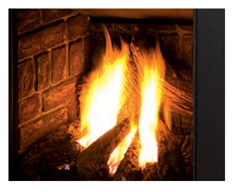
Brick Liner with Log Set