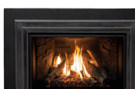
Brushed Graphite Face