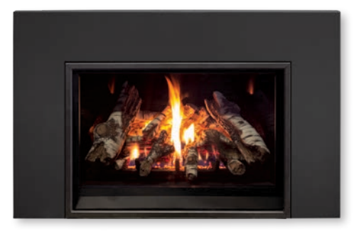
MODERN Available for the E20, E30, E33, & E44