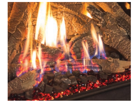
Adjustable Ember Bed Lighting