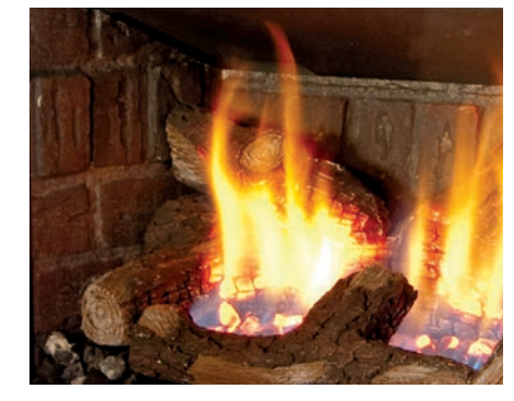
Brick Liner with Log Set