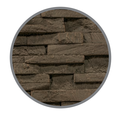
LEDGESTONE LINER Available for the Q1, E30, EX32, E33, EX35, & E44