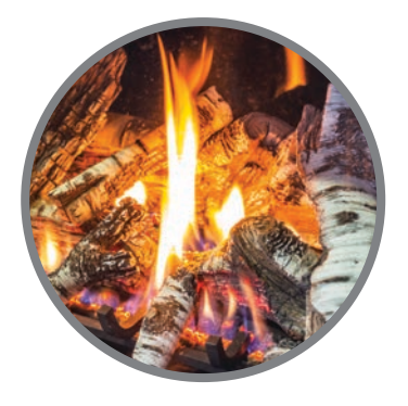
BIRCH LOG SET Available for the E30, E33, E44