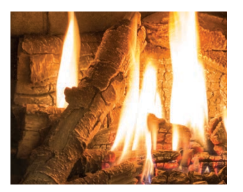
Ultra HD Log Set with Brick Liner