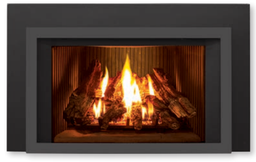
BORDERVIEW Available for the E30 & EX32 Powder Coated Grey