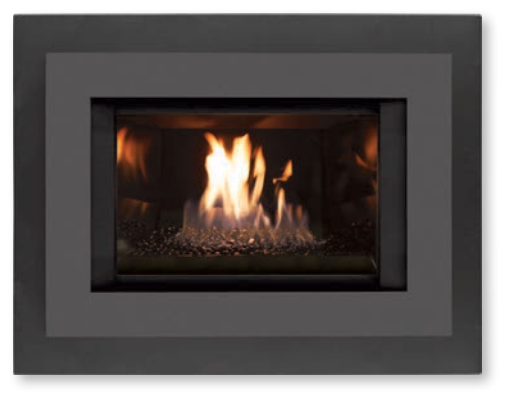
BORDERVIEW PLUS 4S Available for the E30 & EX32 Powder Coated Grey