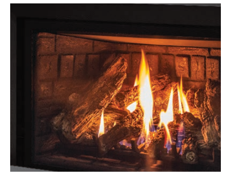
Traditional Log Set with Brick Liner