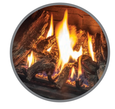
TRADITIONAL LOG SET Available for the E25, E30, E33, & E44