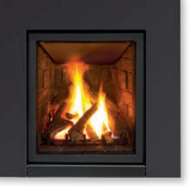
Q1 MODERN Available for the Q1