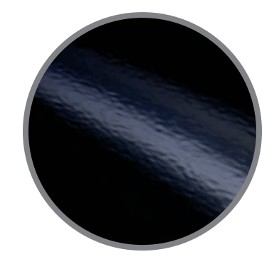
BLACK ENAMELED STEEL LINER Available for the Q1, E20, E30, EX32, E33, EX35,& E44