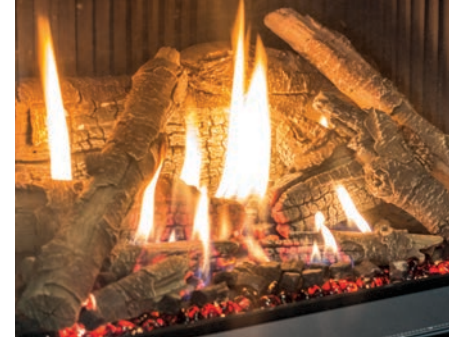
Ultra HD Log Set with Fluted Liner