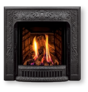
VICTORIAN FACE Available for the Q1 Painted Black or Antique Bronze