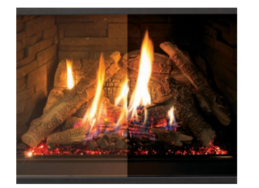
Firebox Top Lighting (Left=On, Right=Off)