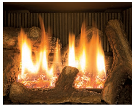
Fluted Liner with Log Set