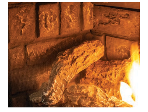
Optional Brick Liner