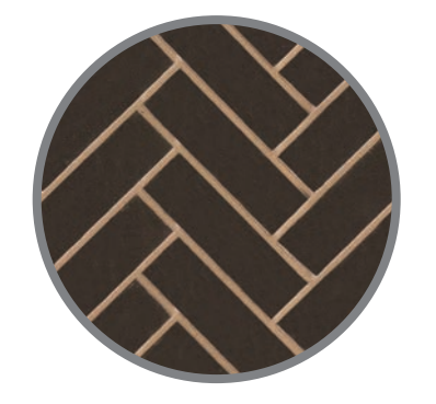
HERRINGBONE LINER Available for the E30, EX32, E33, EX35, & E44