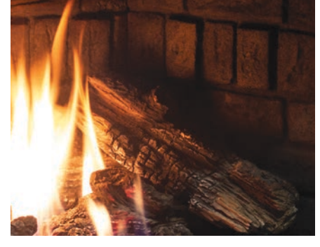
Brick Liner with Traditional Log Set