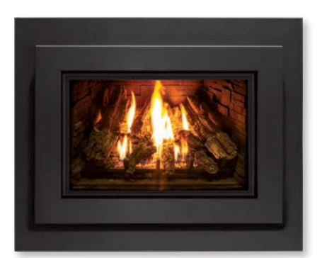
4S CONTEMPORARY Available for the E33, EX35