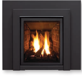
CONTEMPORARY W/TRIMMABLE PANEL Available for the Q1