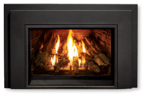
CONTEMPORARY Available for the E20, E30, E33, EX32, EX35, & E44