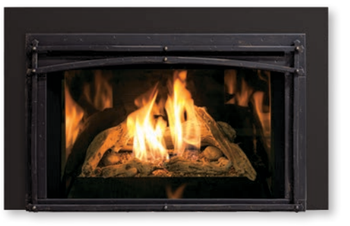
FORGEWORKS Available for the E30, E33, EX32 & EX35 Midnight Bronze