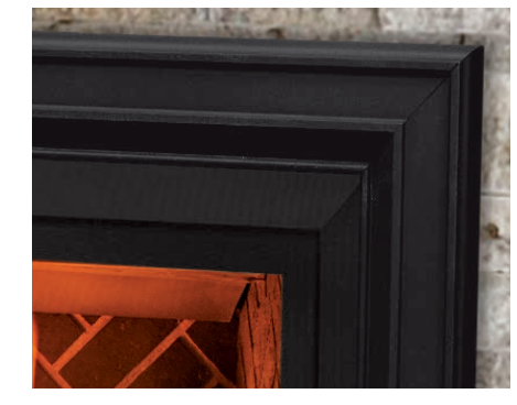
Cast Plus Surround