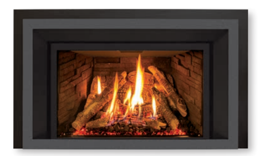
DESIGNER SERIES SURROUND Available for the E30, E33, EX32 & EX35 Powder Coated Grey • Powder Coated Silver • Powder Coated Bronze