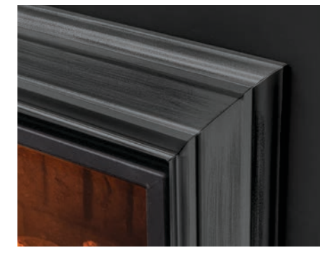
Galiano Surround - Brushed Graphite