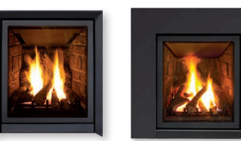
MINIMAL SURROUND Available for the Q1