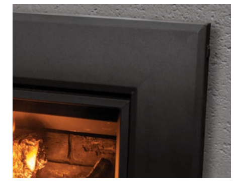
Formed Steel Surround