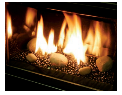
Black Glass with Decorative Stones