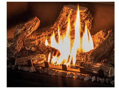
Traditional Log Set