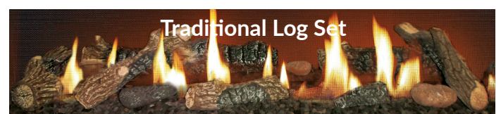
Traditional Log Set