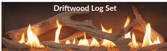
Driftwood Log Set