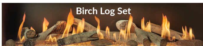
Birch Log Set

Although not required, these decorative options allow you to personalize your fireplace with a little added style.