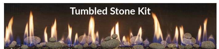
Tumbled Stone Kit