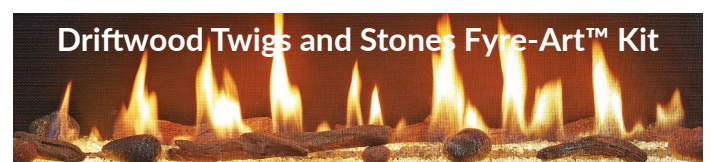
Driftwood Twigs and Stones Fyre-Art™ Kit