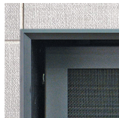
Beveled Tile Trim Kit

Gallery Face Black Painted Accommodates tile or stone facing up to 1" deep. It features beveled sides that draw the eye in towards the fire, giving the fireplace a larger presence.