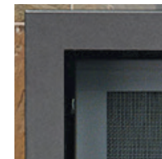
2" Tile Trim Kit