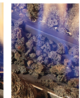
Rock Em- bers