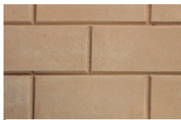
Stacked Tan Brick