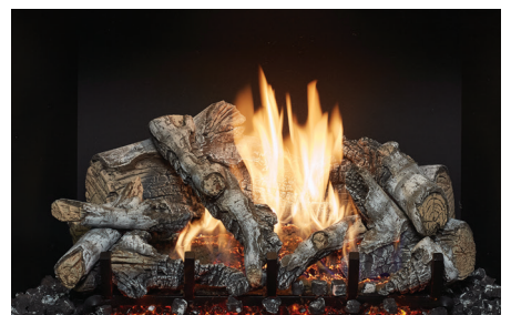
Birch 10-piece high definition log set