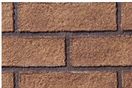
Reversible Common Brick/ Herringbone Brick

Personalize the inside of your fireplace with one of our many stunning firebacks.