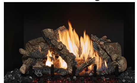
Classic Oak 10-piece high definition log set