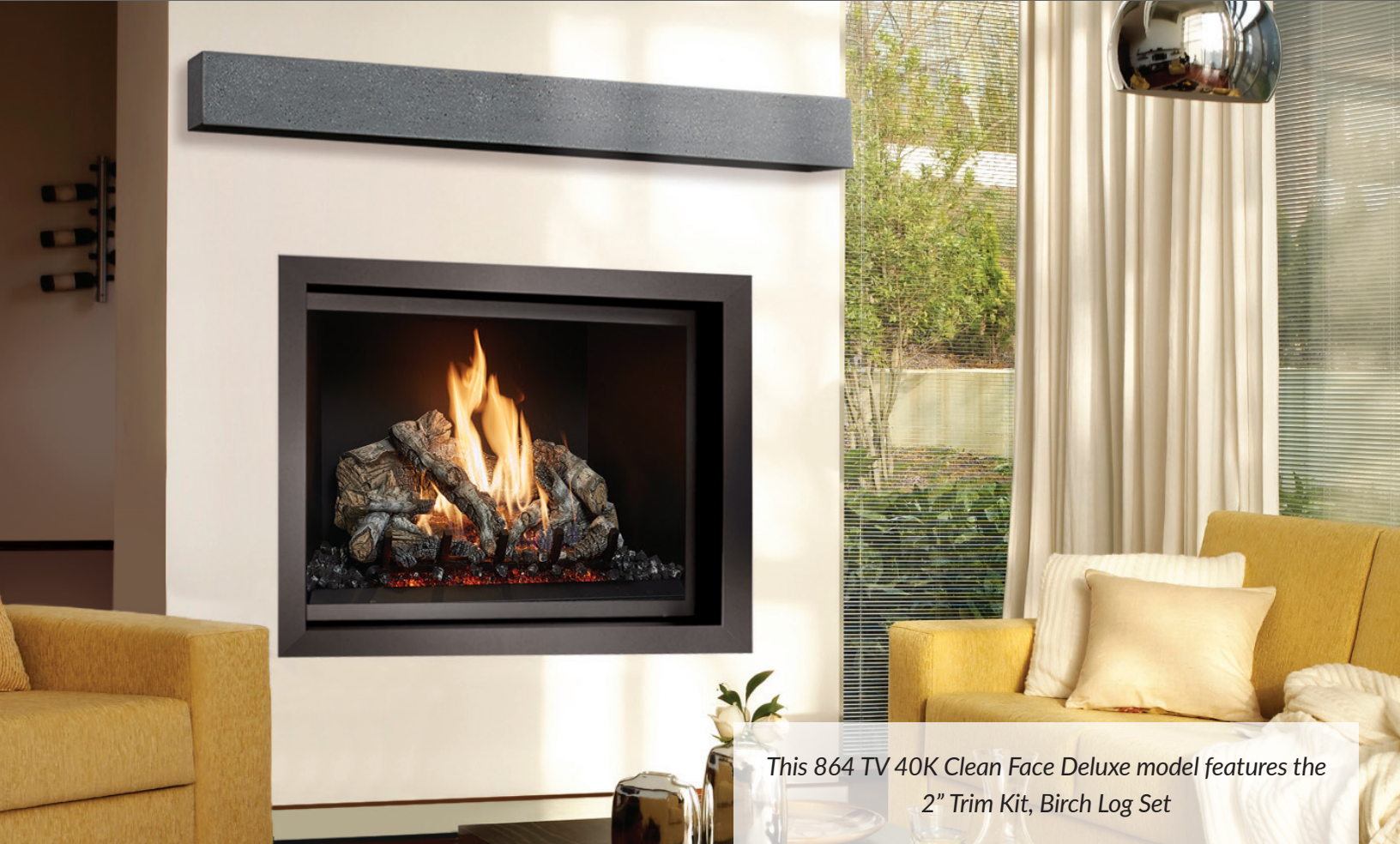
This 864 TV 40K Clean Face Deluxe model features the 2" Trim Kit, Birch Log Set

The 864 TV 40K is our 'best in class' fireplace. This top vent (TV) 40,000 BTU fireplace is a high output heater, ideal for larger homes and living spaces up to 2,000 square feet. The 864 TV 40K is available as a "Clean Face" model with decorative trim, or features our wide selection of designer faces. This fireplace includes realistic Ember-Glo™ ember bed lighting, the high definition Ember-Fyre® II Burner, CoolSmart TV Wall™ option, and your choice of detailed Classic Oak or Birch Log Sets.