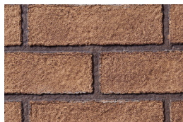
Reversible Common Brick/ Herringbone Brick

Personalize the inside of your fireplace with one of our many stunning firebacks.