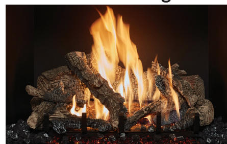
Classic Oak 10-piece high definition log set