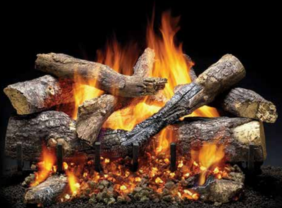
Grand Oak 24" 2-Tier Log Set

For larger fireplaces, the Fireside Grand Oak vented gas log set showcases 11-12 authentic logs from real oak timber molds. An ultramodern burner system creates a multi-level fire. The Outdoor version has such a beautiful fire, friends may ask if they can add a log to it. For gas logs with radiant burner technology, add outstanding realism with the Duzy 5's eight true-to-life ceramic logs, pushbutton ease and Natural Flame™ look.