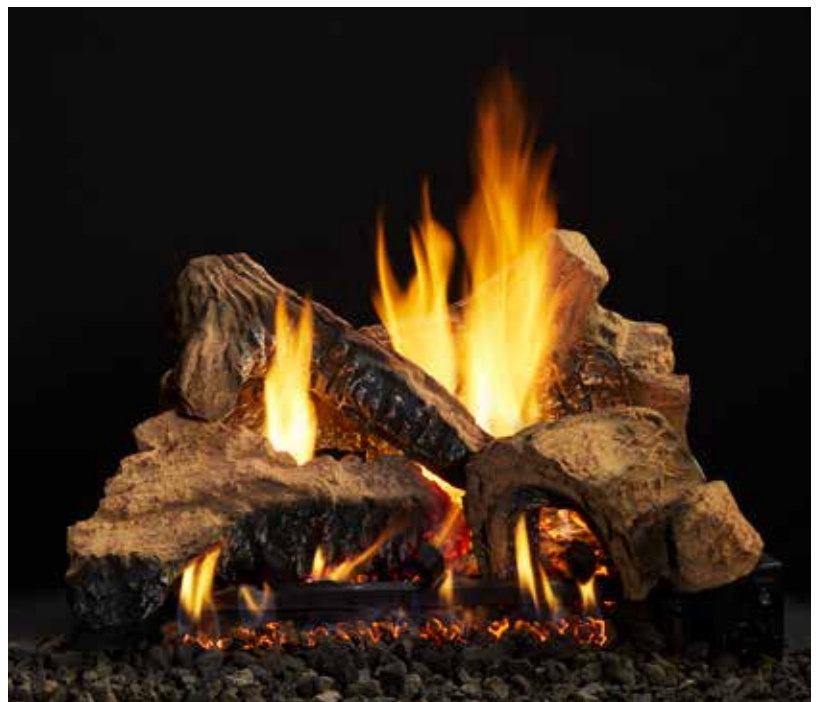
Duzy 2 - 24" Log Set