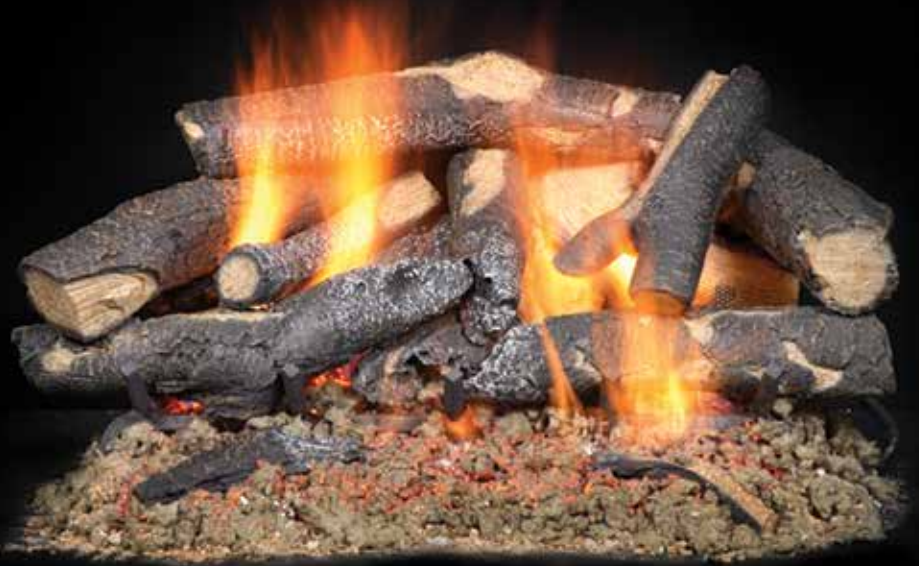
Fireside Supreme Oak - 30" Log Set

For a charred, mature fire, the 12-log Fireside Supreme Oak gas log set is stunningly realistic yet affordable. The detailed concrete logs, molded from real oak, are attractive even when not burning—also in a See-Through model that looks great from either side. In the Duzy 3, durable, glowing logs are convincing while radiant heat technology distributes penetrating warmth with no fan needed.