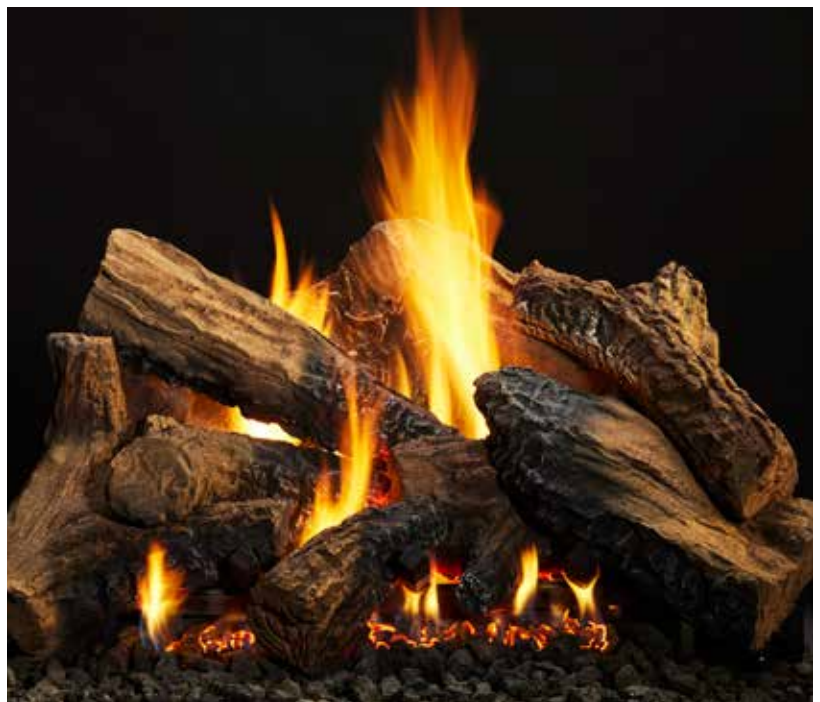
Duzy 5 - 24" Log Set