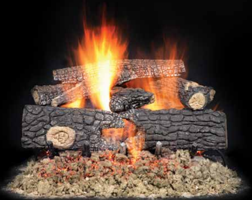
Fireside Realwood - 24" Log Set

Beautiful logs create a beautiful fire, but they don't have cost a lot. The Fireside Realwood gas log set adds bona fide appearance with eight detailed logs at a value price. An Outdoor model features a stainless-steel grate and burner elements to handle the elements. The Duzy 2 fits even narrow wood-burning fireplaces with four ceramic-fiber logs and our patented Natural Flame stainless steel burner, while the Campfire set recreates a natural look with 10-11 ceramic fiber logs.