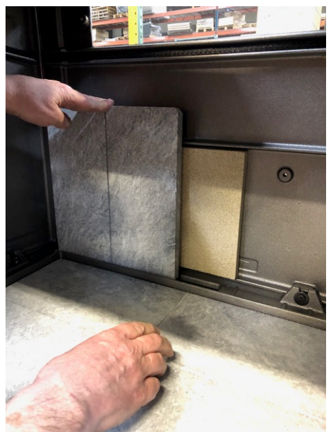
Photo 1. Insulation panel placed behind left rear refractory stone.

1) Place rear insulation panel against the center of the rear casting, along with the left side rear refractory stone.